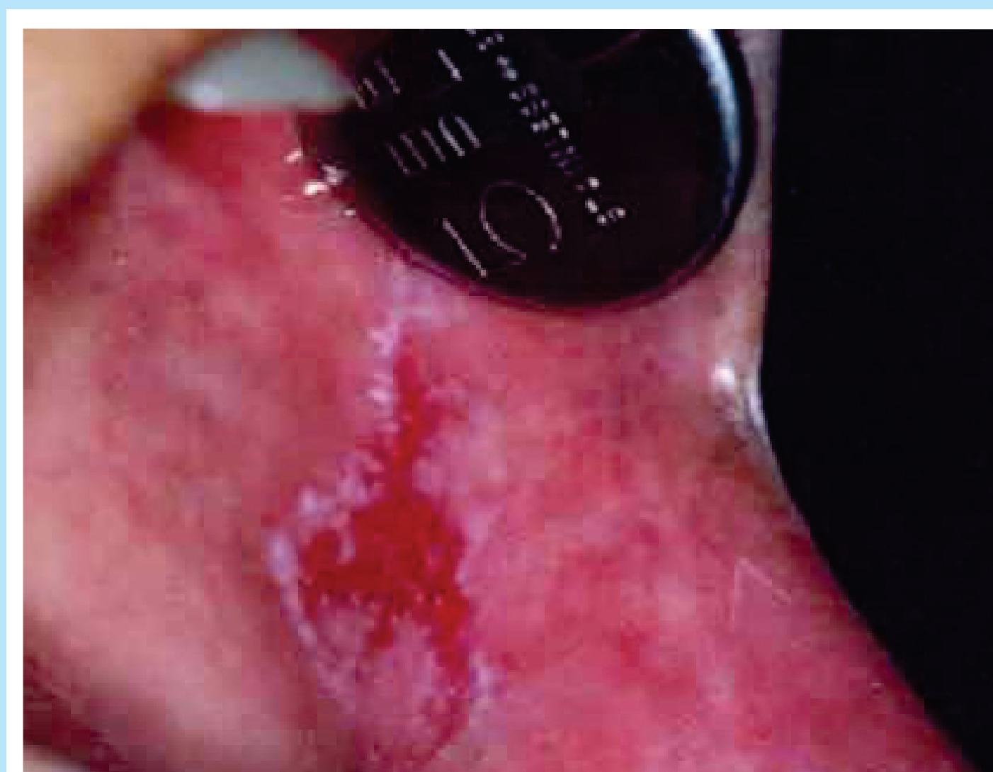
Erosive lichen planus