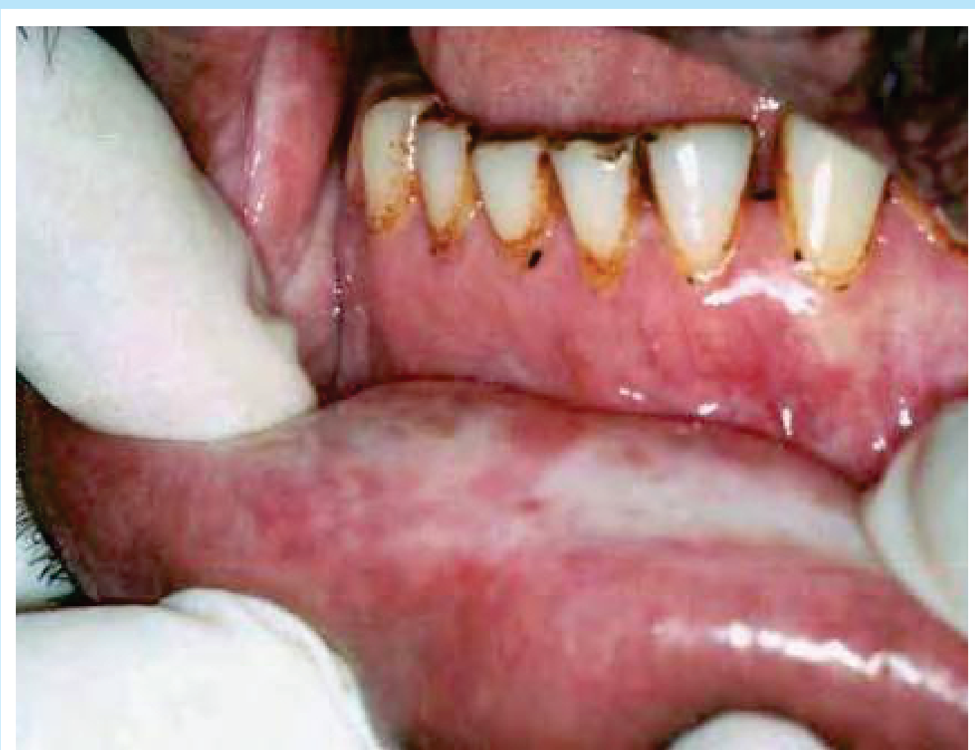
Early sign of oral sub mucous fibrosis