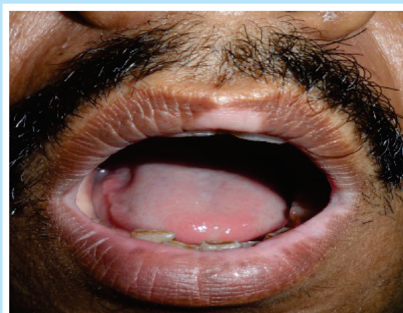
Early sign of oral sub mucous fibrosis