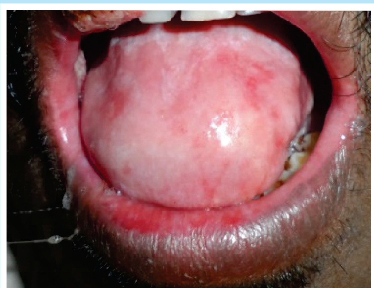
Late sign of oral sub mucous fibrosis